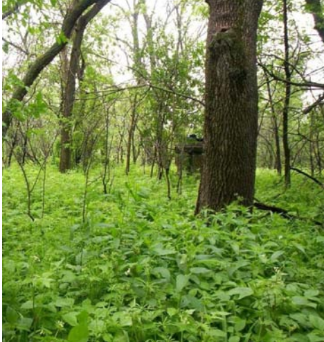
BOTTOM: Trahm’s Farm Cemetery, Vivian Twp.