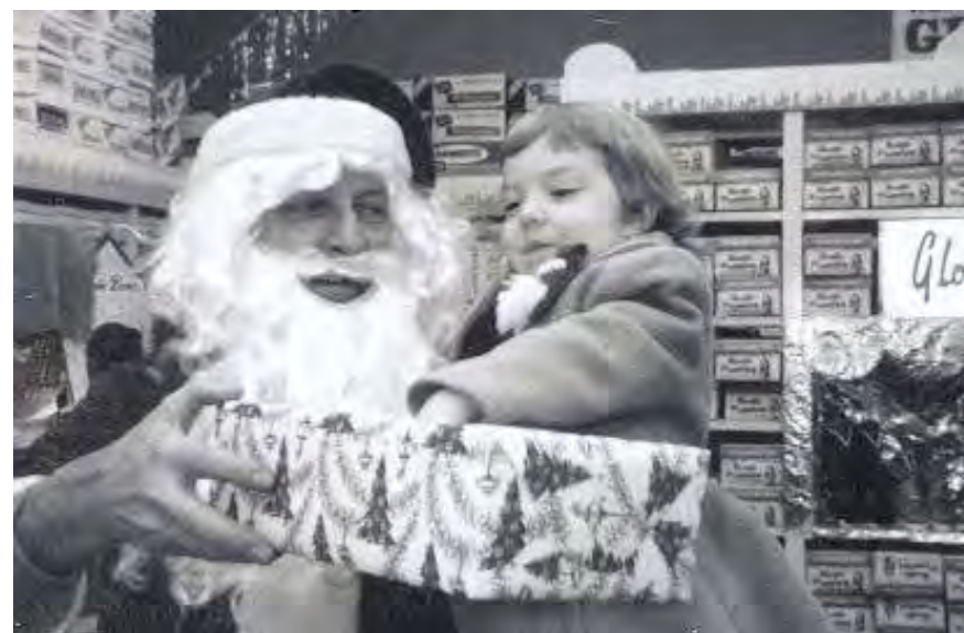
In 1948 Santa Claus is visiting at Wolf & Habein's Department store. Do you know who's playing Santa?