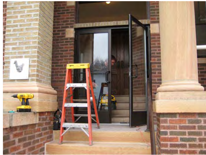
Pictured above: Waseca Glass workmen install the new front doors of the Museum in October.

And we want to thank all those who gave on November 17, the "Give-to-the-Max" Day promoted by the Minnesota Community Foundation and made possible by corporate sponsors who together contributed $500,000 to add to the donations that day, and to pay for the online credit card processing fees—making it possible for your entire donation to go to each benefiting nonprofit. WCHS raised $2,140 in one day! Remember that this "Donate Now" link is right on the main page of our website— www.historical.waseca.mn.us .