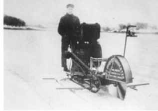
ICE HARVEST on CLEAR LAKE FEBRUARY 10 Public invited!