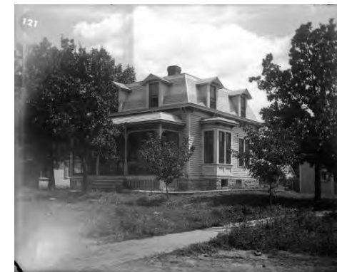
Hawkes family residence, Waseca, MN, c. 1900, part of the MDL Project online.

MDL Accepts More Waseca County Images Minnesota Digital Library website now contains more Waseca County content. This program provides for free scanning and guidance with