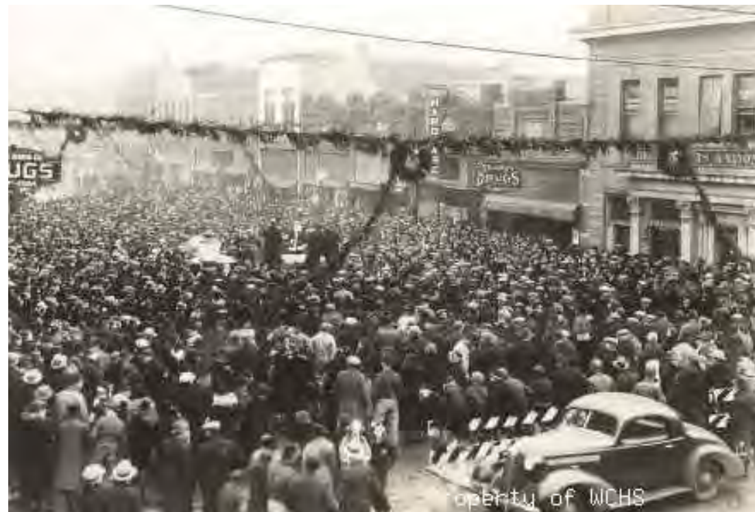
Waseca Merchants Trade Festival final prize drawing on December 24, 1936 Here is mainstreet Waseca showing hundreds of people surrounding a platform in the middle of N. State Street with Santa Claus and three men, drawing the winning ticket to win the automobile parked in the foreground. Notice the visible businesses are Sticky's Drug Store, Farmers National Bank, Waseca Hardware and dentists offices.